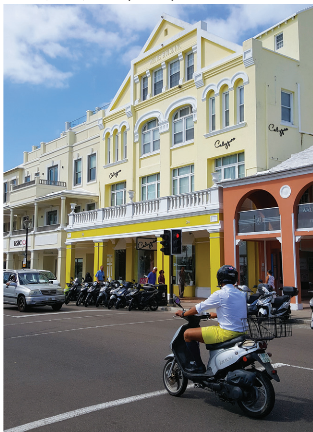
Front Street, Hamilton, Bermuda.

multi-week workshops provide guidance to entrepreneurs at various stages of their business from ideation and start-up phases, to stability and growth phases.